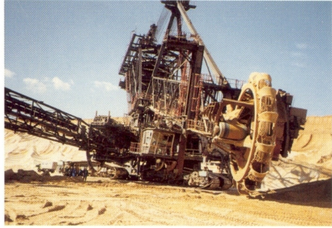
Bucket wheel excavator